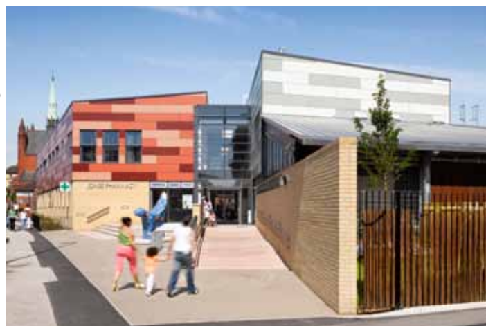
Picton Health Centre, MBLA architects

Liverpool NHS Primary Care Trust and Liverpool & Sefton LIFTco are locating healthcare facilities according to pedestrian access. The equitable provision of healthcare facilities across the city followed a survey of residents that identified an optimum 15-minute maximum walking time to any health centre. A network of new treatment centres are being sited across the city within 15 minutes walk of every residential address. www.lshp.co.uk