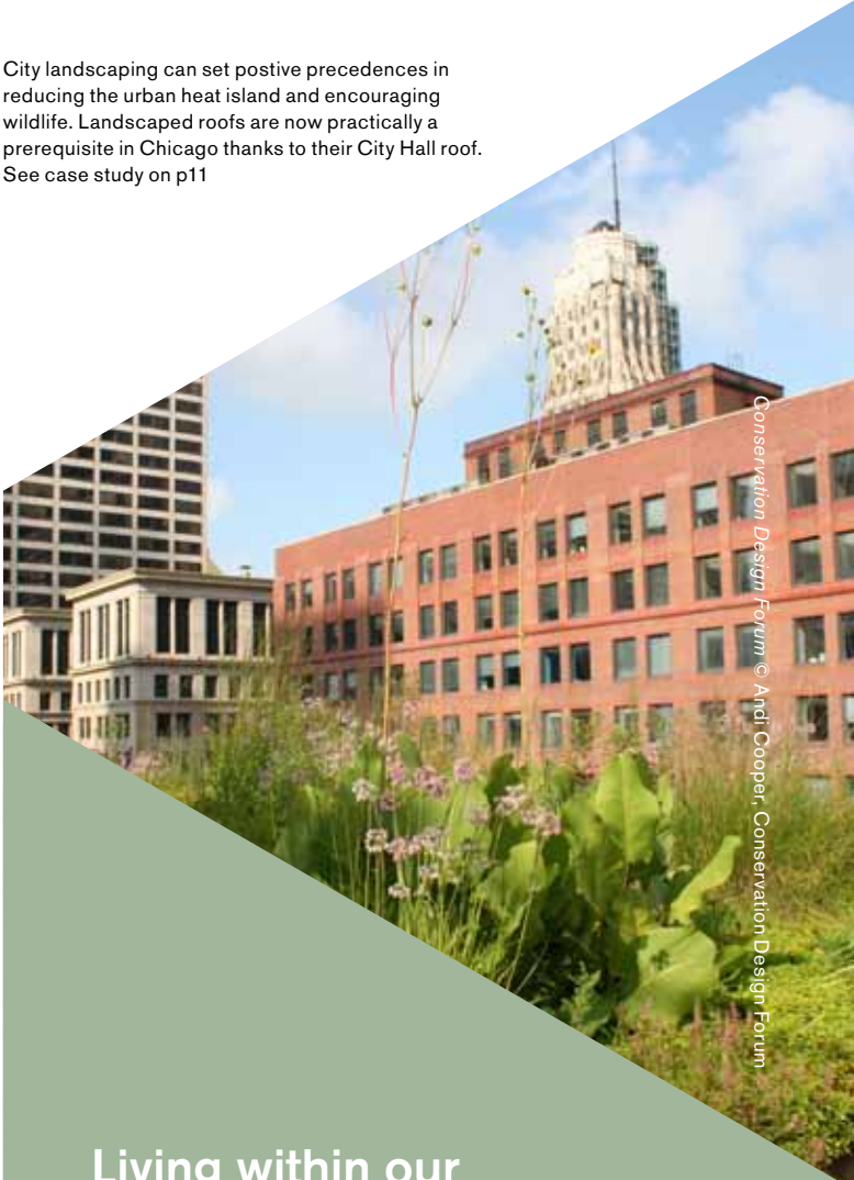
Conservation Design Forum

City landscaping can set positive precedences in reducing the urban heat island and encouraging wildlife. Landscaped roofs are now practically a prerequisite in Chicago thanks to their City Hall roof. See case study on p11