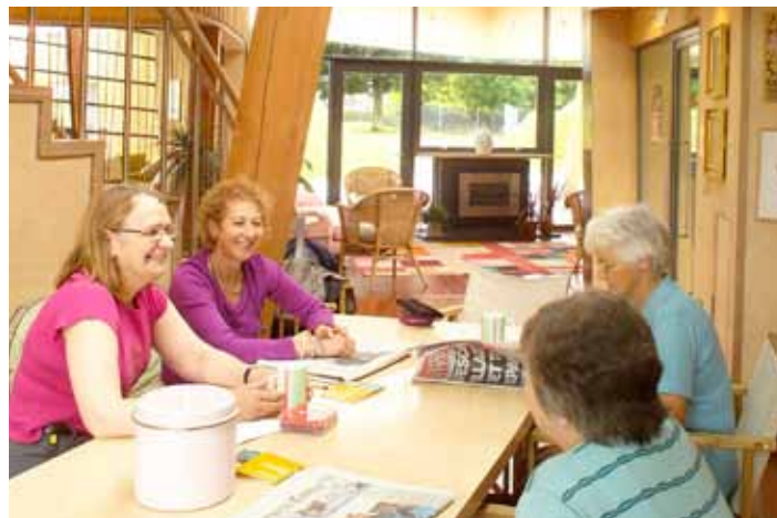
Maggie's Highlands, Inverness. Page & Park architects

Maggie's Cancer Support Centres offer a community of advice and support for cancer patients within carefully designed and welcoming buildings that have a domestic feel. Each centre is situated beside an NHS Cancer Hospital and has been designed to be as un-institutional as possible, with light, space and warmth. The heart of the centre is always the informal kitchen area. In 2009 Maggie's London became the first health building to win the most prestigious UK architecture award, the RIBA Stirling Prize.