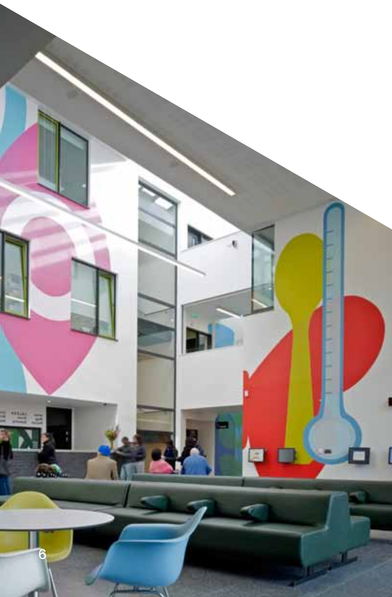
Airy, welcoming reception area at the Kentish Town Health Centre, where health workers and doctors now communicate better and resources are saved through space-sharing. See case study on p16

The benefits of integrating and improving services will be fully realised only if the design and setting create a therapeutic environment that works for patients and staff; if buildings are adaptable and responsive to changes in healthcare delivery; and if services are easy to get to on foot, bicycle and public transport.