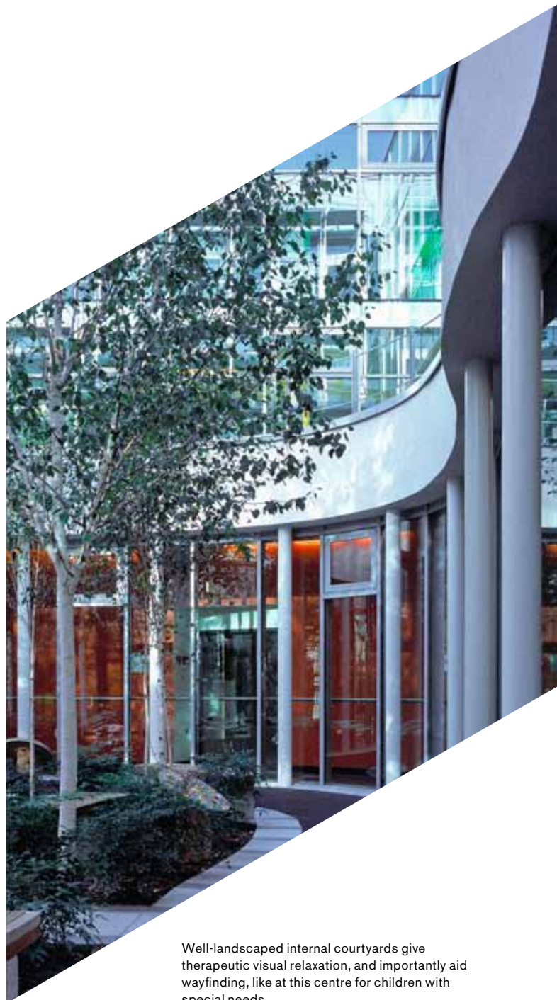
Well-landscaped internal courtyards give therapeutic visual relaxation, and importantly aid wayfinding, like at this centre for children with special needs