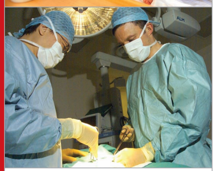
Calderdale and Huddersfield, an "ordinary" local hospital that is doing extraordinary work to improve care and engage with the community