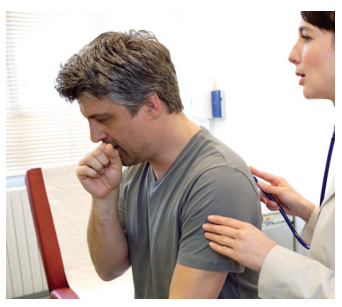
A care plan has reduced variability of services for COPD patients

has been on where he has met other people with same condition. He has been encouraged to take exercise and lose weight, and his condition has remained stable for much of this time.