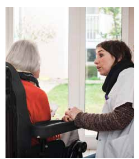
New voices: speech therapists are among those training in research

"For a long time, I had the sense that our work as speech and language therapists needed to be more evidence-based," he says. "I wanted to make some efforts in that direction, but felt neither equipped nor confident to do it.