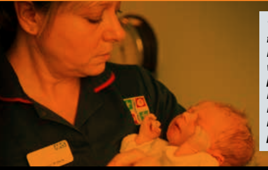
The ICA Programme is funded by Health Education England who work in partnership with the National Institute for Health Research, who manage the programme

HEE/NIHR Integrated Clinical Academic Programme for non-medical healthcare professionals