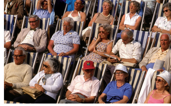
An increasing ageing population can necessitate finding a different way of commissioning services

Pathway redesign need not be a lengthy process – an outline model and key quality outcomes could be completed in one or two days. For long-term conditions, this process could involve a one day workshop for GPs, secondary care staff, other clinicians, the local authority, patients, CCG staff and CSS