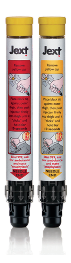
Adrenaline on hand: sufferers are given auto-injectors such as these