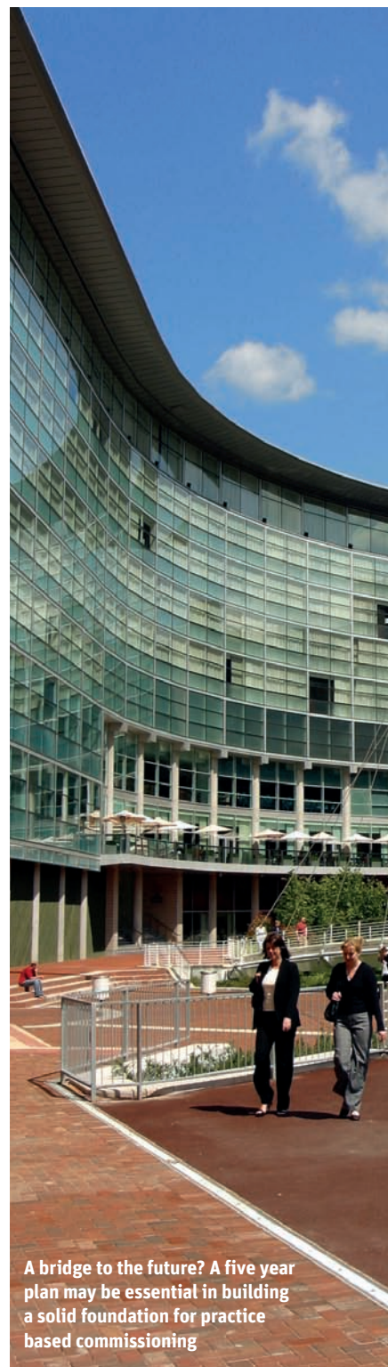
A bridge to the future? A five year plan may be essential in building a solid foundation for practice based commissioning

Another piece of the jigsaw was a five year road map, setting out how the PBC would gradually move from carrying out the PCT's objectives, to earning more autonomy including delegated decision