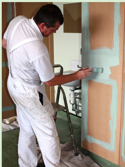
Work underway to prepare Gable Ward for the arrival of stroke patients

Making space for the relocation from Yewdale Ward has proved a challenge and has required