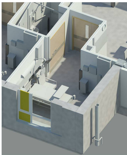
An artist's impression of a single en-suite bedroom in the new hospital

Services on Level 3 include: an Emergency Floor, Acute Admissions, CCU, Critical Care beds, Radiology, Outpatients Department, Ophthalmology, Endoscopy, Dental and Orthodontics and Minor Operations. The Emergency Floor is also integrated with the out-of-hours GP services provided by CHOC (Cumbria Health on Call). Access and