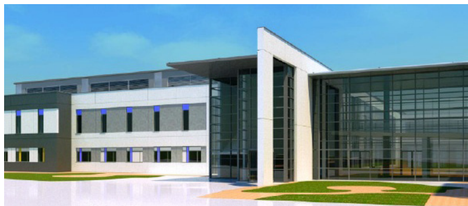
An artist's impression of the main entrance of the new West Cumberland Hospital

Some compromises have had to be made, most notably that we are now having to retain some of our inpatient beds within the existing buildings. However, we have continued to ensure that the total number of beds in the redeveloped hospital will be in line with the commitments made